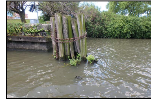
Photo 1 Northwest Dolphin