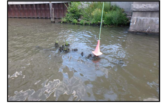
Photo 2 Northeast Dolphin